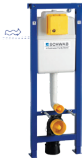
DUPLO WC 380 IN.CON. 16x2 112cm