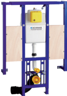
DUPLO WC 380 L VARIO SP