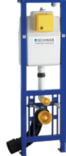
DUPLO WC 380 VARIO