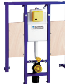
DUPLO WC 380 L SP